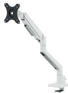
DS70-250BL1 / WH1 / SL1 Screen size: 17-35" Capacity: 9 kg