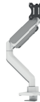
DS70-450BL1 / WH1 Screen size: 17-42" Capacity: 15 kg