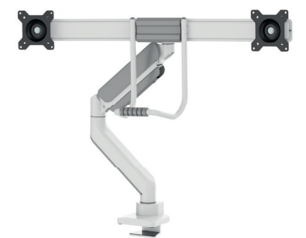
DS75-450BL2 / WH2 Screen size: 17-32" Capacity: 8 kg (2x)