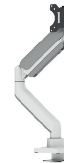
DS70PLUS-450BL1 / WH1 Screen size: 17-49" Capacity: 18 kg/curved 14 kg Strengthened head