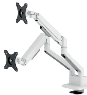
DS70-250BL2 / WH2 / SL2 Screen size: 17-32" Capacity: 9 kg (2x)