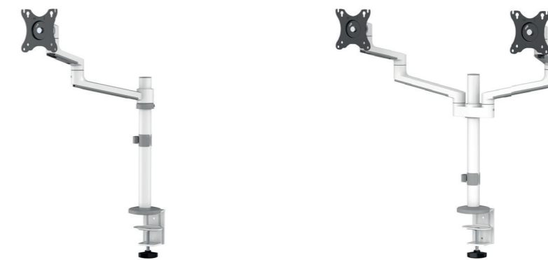
DS60-425BL1 / WH1 Screen size: 17-27" Capacity: 8 kg